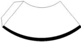
display stand post

Most colorful results are obtained with a photo setting, and photo paper